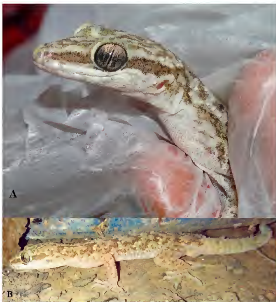
Fig. 2. Cyrtopodion himalayanus (A) Enlarged lateral view of head. (B) Full lateral view of the body.